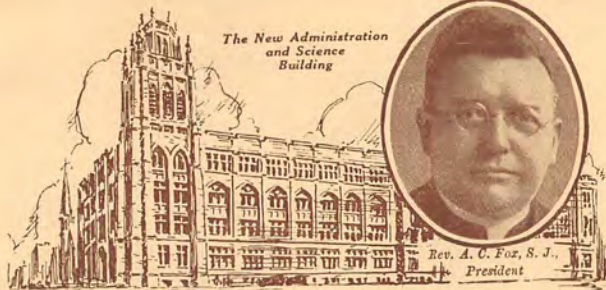
The New Administration and Science Building

For special Rates to Rural Route Addresses in Wisconsin and Upper Michigan Write to The Milwaukee Journal Mail Subscription Department.