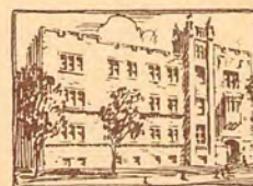
College of Dentistry