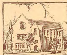
The Law Building