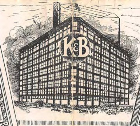
STATION W.C.A.E. KAUFMANN & BAER CO.