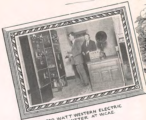
500 WATT WESTERN ELECTRIC TRANSMITTER AT W.C.A.E.