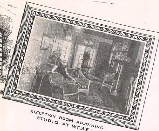
RECEPTION ROOM ADJOINING STUDIO AT W.C.A.E.