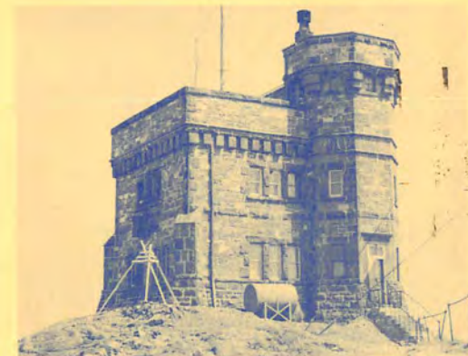
CABOT TOWER ST. JOHN'S, NEWFOUNDLAND

Where on Dec. 12, 1901, the Italian genius, Guglielmo Marconi, waiting patiently on Signal Hill, received the first Trans- Atlantic wireless Signal.