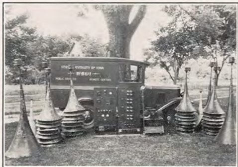
WSUI Public Address System