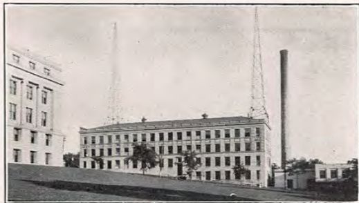
Engineering Building, Home of WSUI