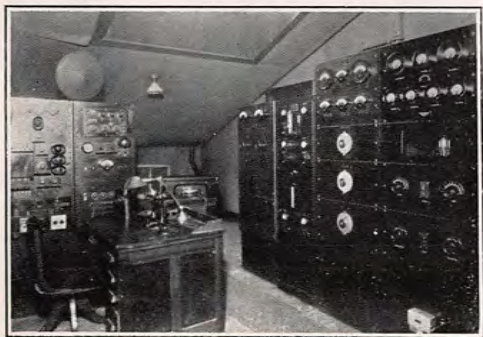
Transmitting Equipment WSUI