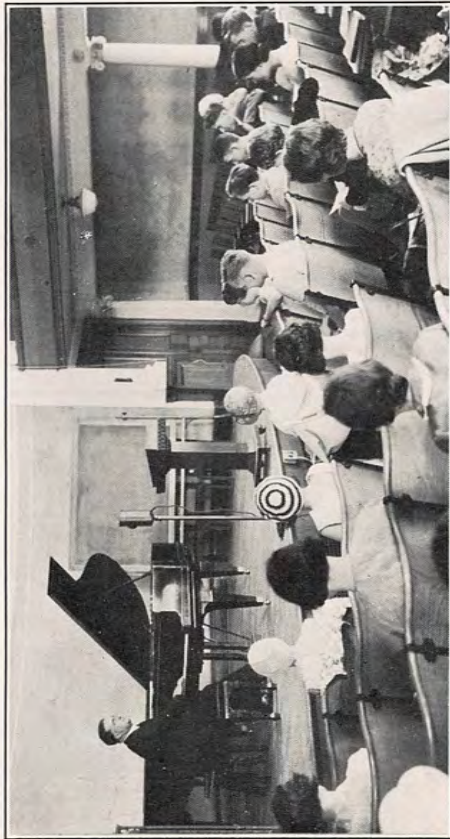
WSUI Broadcasting from Classroom

9:00 to 10:00 A. M. Mon. Wed. Fri. Sat. News Service, Markets, Weather Reports and Forecast, Daily Smile, Music