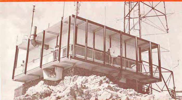
The Observation Deck on Ranger Peak offers a 7,000 square mile view of three states and two countries from its spacious, railed veranda.