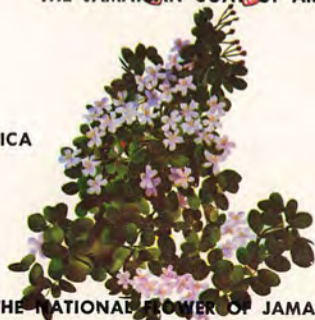
THE NATIONAL FLOWER OF JAMAICA