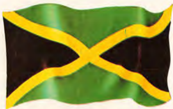
THE JAMAICAN FLAG