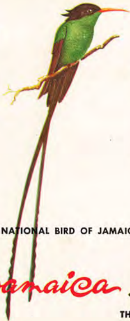
THE NATIONAL BIRD OF JAMAICA