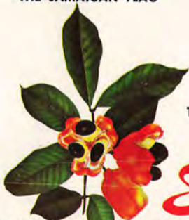
THE NATIONAL FRUIT OF JAMAICA