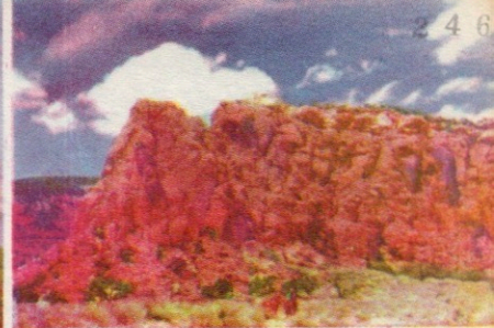
TOM'S THUMB WAYNE WONDERLAND