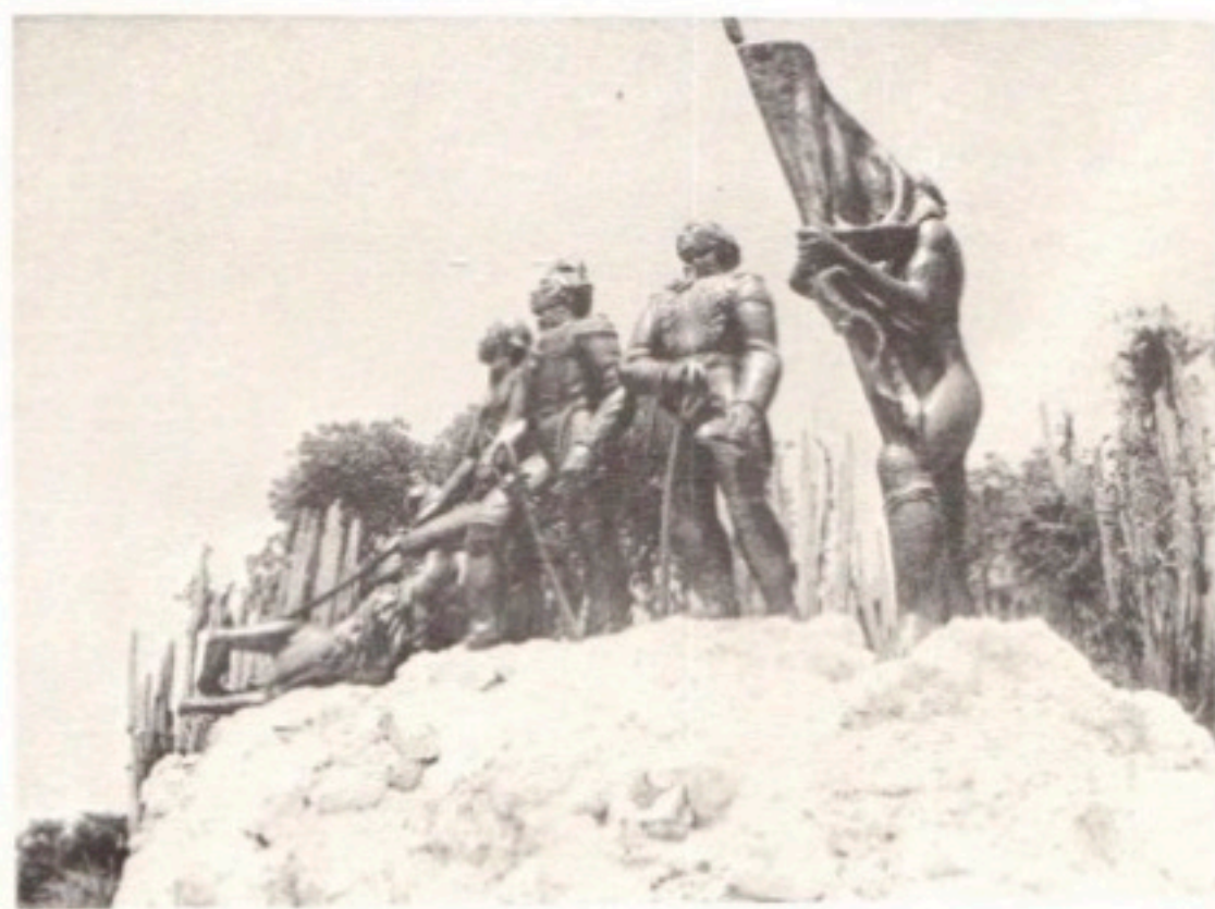
"Stand fast in the liberty where Christ has made you free" (The Bible)