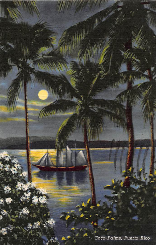
Coco Palms, Puerto Rico