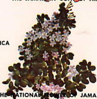
THE NATIONAL FLOWER OF JAMAICA