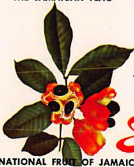
THE NATIONAL FRUIT OF JAMAICA