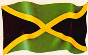
THE JAMAICAN FLAG