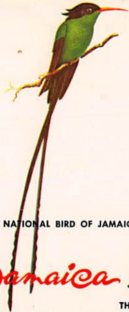
THE NATIONAL BIRD OF JAMAICA