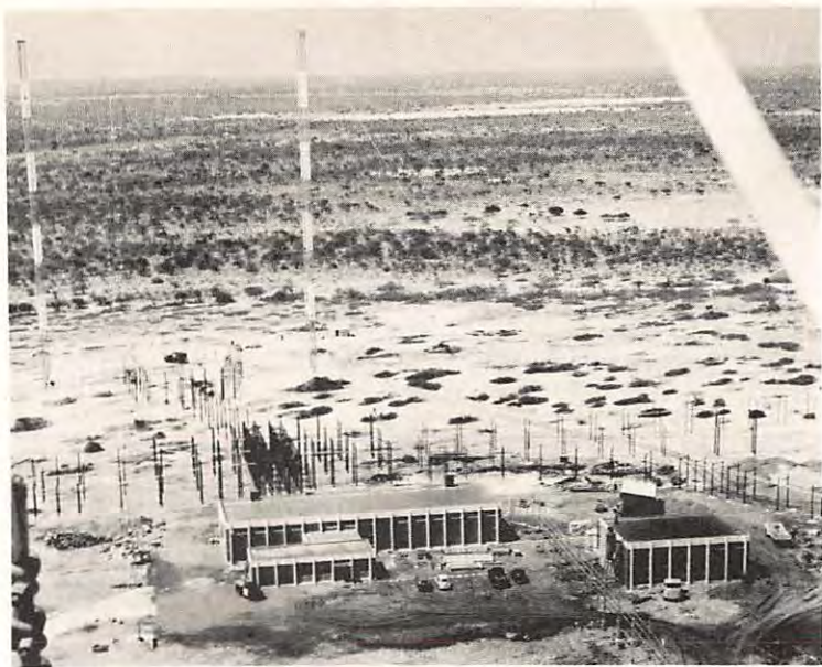
Panoramic view of Trans World Radio's transmitter and diesel generator buildings flanked by the short wave antenna fields, as seen from the 760 foot (233 meters) medium wave antenna.