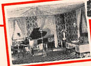
Studio No. 1

Sunday 6:00 to 7:00 p.m. —Services Central Church of Christ, followed by musical program till 10:00 p.m.