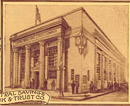
CENTRAL SAVINGS BANK & TRUST CO.