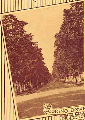
LOOKING DOWN A RESIDENCE STREET