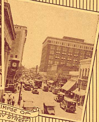
A GLIMPSE OF A BUSY STREET