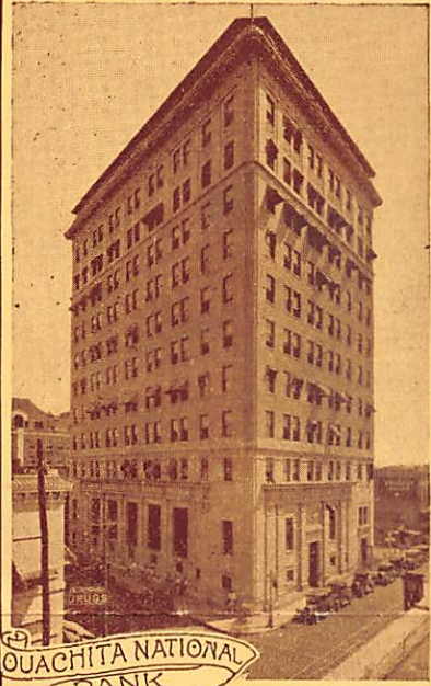
OUACHITA NATIONAL BANK