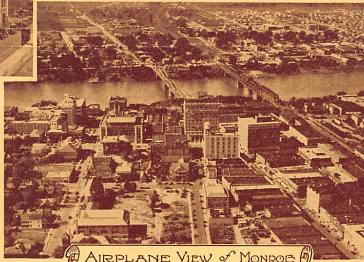
AIRPLANE VIEW OF MONROE