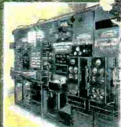
WTMJ'S TRANSMITTER WITH ANTENNAE TOWERS, AND BROADCASTING EQUIPMENT