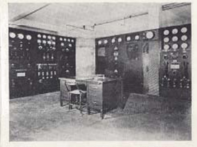
INTERIOR VIEW_TRANSMITTER PANEL

You'll like it here! Visit us soon! In the Winter Playground of America.