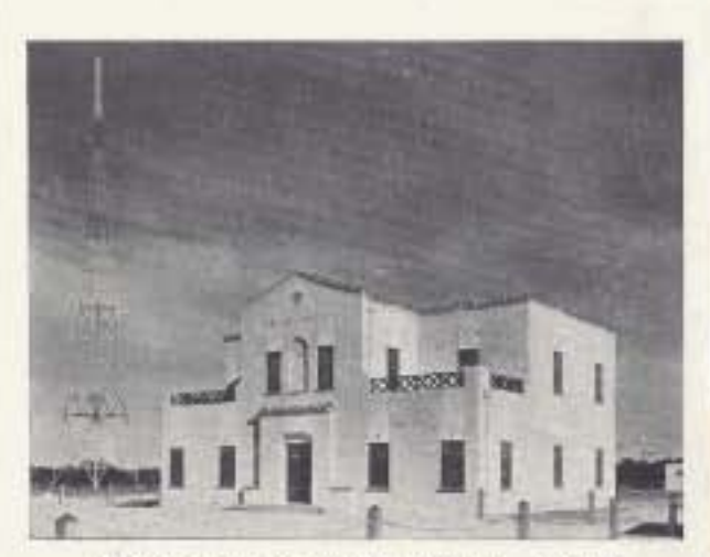
WOAI TRANSMITTER_SELMA, TEXAS