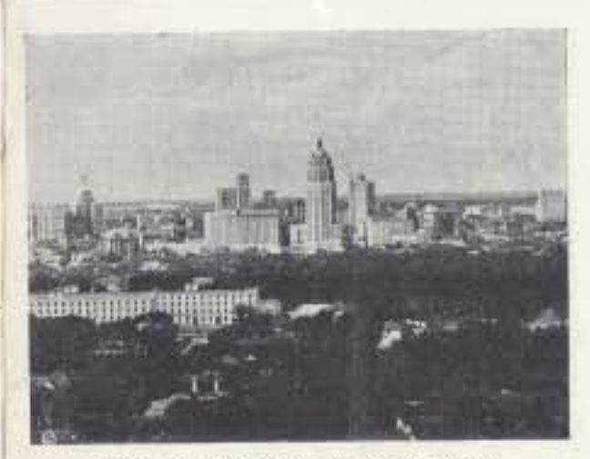
BUSINESS SECTION...SAN ANTONIO