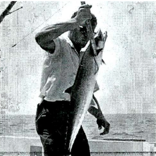
SPORT FISHING ABUNDANT