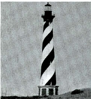
CAPE HATTERAS LIGHTHOUSE