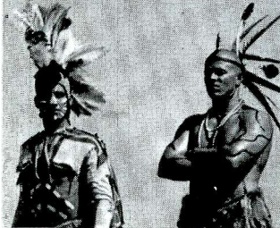
LOST COLONY INDIANS