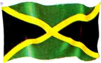
THE JAMAICAN FLAG