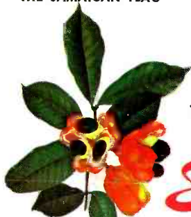
THE NATIONAL FRUIT OF JAMAICA