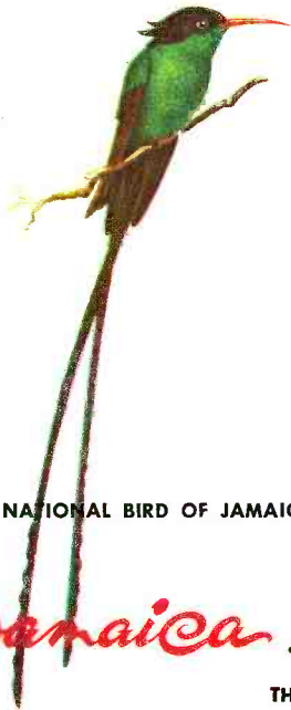
THE NATIONAL BIRD OF JAMAICA