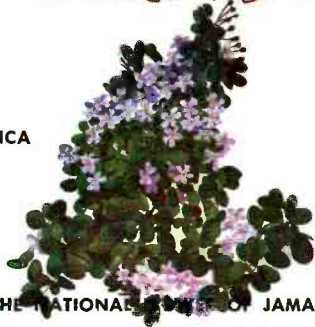
THE NATIONAL FLOWER OF JAMAICA