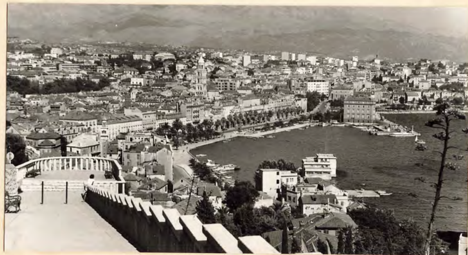
SPLIT — PANORAMA

RADIO-TELEVIZIJA BEOGRAD P. O. Box 880 Beograd YUGOSLAVIA