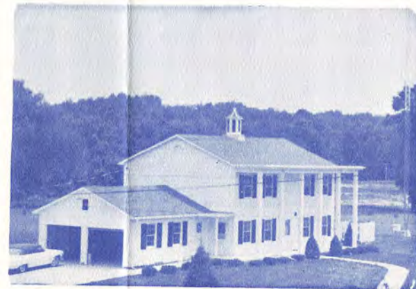
KBEW Studios and Transmitter

With Earth so Rich . . . this Beautiful Radio Station Grew!