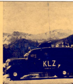
KLZ Mobile Unit in Shadow of Mt. Evans