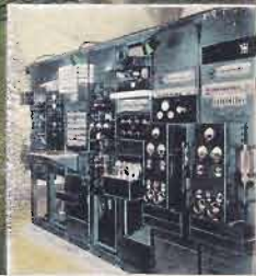
WTMJ'S TRANSMITTER WITH ANTENNAE TOWERS, AND BROADCASTING EQUIPMENT