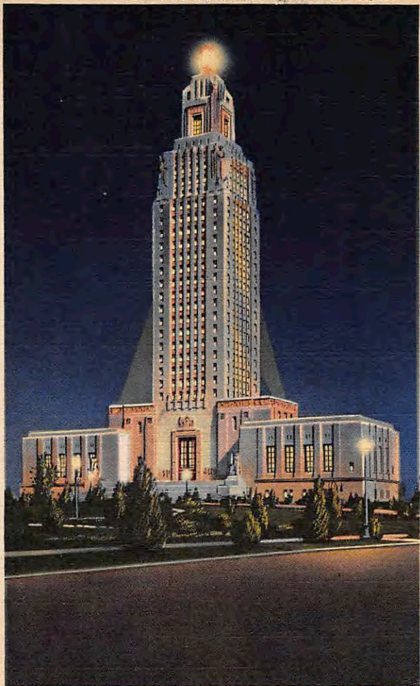
THE STATE CAPITOL AT NIGHT, BATON ROUGE, LA.