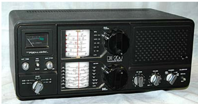
The Realistic DX-200 (vintage 1981-1983)