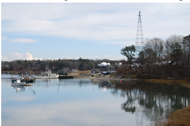
One of the remaining Marconi Wireless antenna towers overlooking Ryder's Cove.

It was 110 years ago when Marconi completed the first transatlantic wireless communication, taking place between England and Signal Hill, Newfoundland, commemorated by the now infamous Newfie DXpeditions which by the way will be celebrating its 20th anniversary this year. In 1903 Marconi made the first wireless two-way communications between England and Wellfleet on Cape Cod, a U.S. mainland site selected specifically for its proximity to Europe. Marconi later envisioned a network of wireless communication stations for ships at sea, an idea which ultimately proved its worth in 1912 when over 700 people aboard the sinking Titanic were saved after an S.O.S. transmitted from the ship's Marconi Room alerted rescuers. In 1914 WCC Chatham replaced Wellfleet as part of the network of Marconi land-based wireless radio stations that would link North America, Europe, Japan, and voyagers across the Atlantic and Pacific Oceans. However WCC "Wireless Cape Cod" was to take on a much more significant place in history.