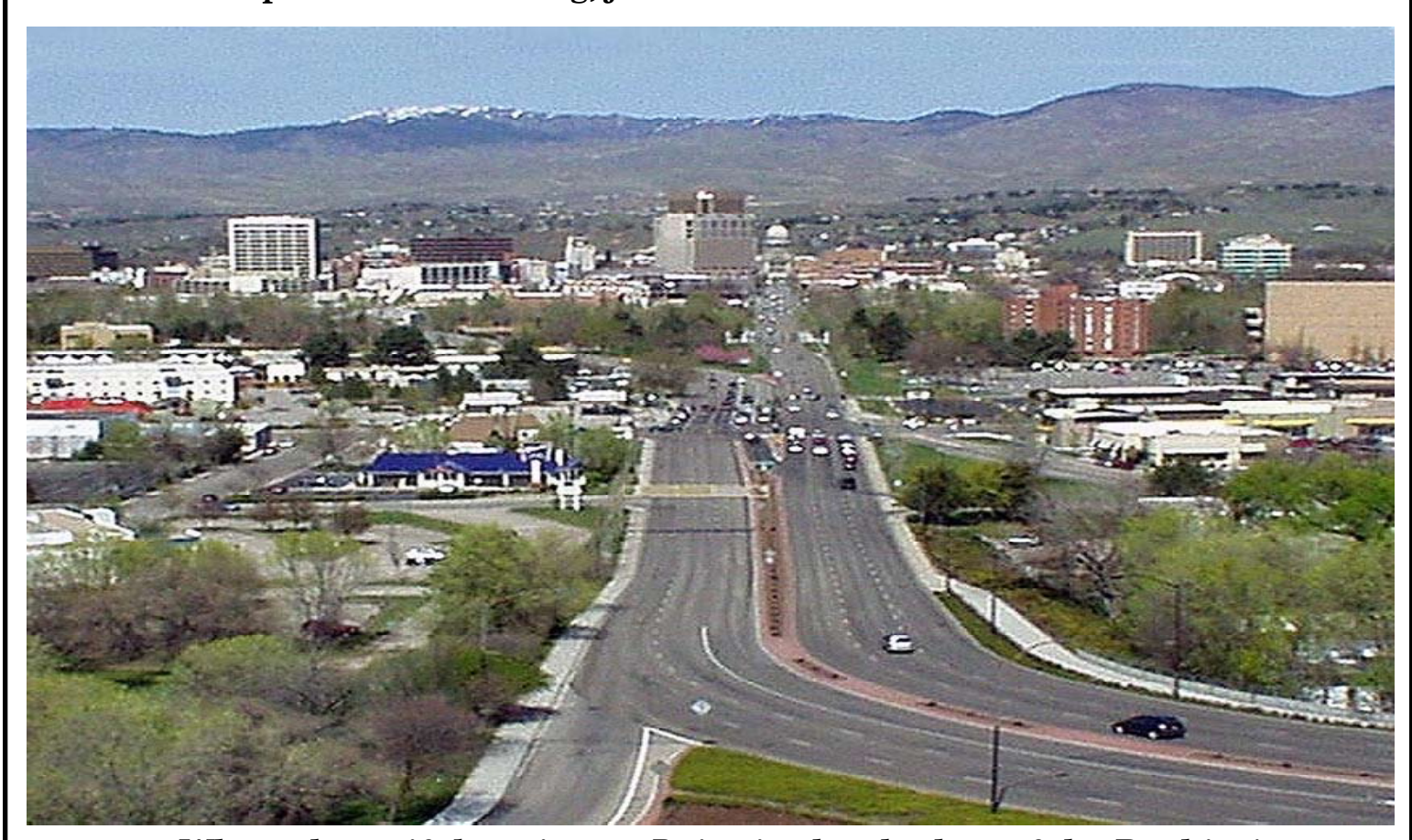
What a beautiful setting — Boise in the shadow of the Rockies!

Convention Registration: $15 per club member - $10 for a spouse. In lieu of a pre-paid banquet this year, we will all meet at a restaurant where you can order what you want from the restaurant's menu so we can keep the registration costs this low. Send your registration fee, payable to the National Radio Club, to PO Box 5192, Sun City Center, FL 33571-5192 no later than August 15. You may also register and pay via Paypal from our website http://www.nrcdxas.org; just follow the links.