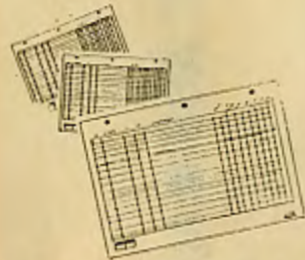
STATIONARY NRC stationery with NRC logo and header in black ink. 100 sheets for $4.80. For Members Only

Hassinger says station engineers will be able to make RF calculations in most simple cases, but con-