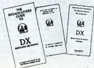
GUIDE BROADCASTER'S GUIDE TO DX. A tri-fold guide for use with reception reports explaining DXing, how the NRC was formed and the importance of QSLs to DXers. $1 for 20.