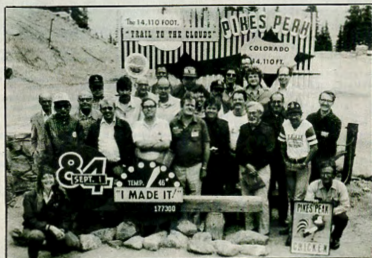
??? OFFICIAL NRC PHOTO ?????