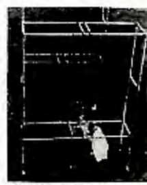
C&S Antennas HF active loop antenna

KENT, ENGLAND—C&S Antennas Ltd. has used its HF active loop system to build a directional antenna with a frequency range of 500 kHz to 8 MHz and directivity in excess of 10 dB. Designated "Type B1A," the new system consists of at least four 3-m 2 loops with a wide-band amplifier at the base of each. A coaxial cable feeds power to the amplifiers as well as transporting RF signals from each loop to a combining unit. The antenna is of particular interest to organizations wishing to monitor the marine radiotelephone and telegraphy bands and the medium-wave broadcasting band. The configuration and spacing between individual loops determines the directivity of the array, so larger systems can be built to provide greater directivity and switchable radiation patterns.