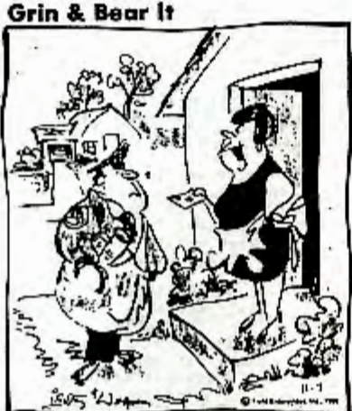
"Of course I left off the zip code...it was mailed before there was a zip code!"